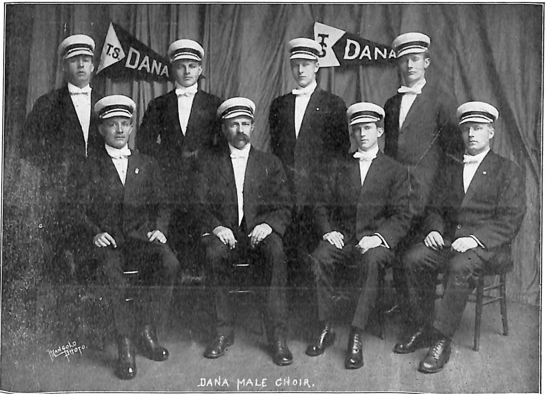
DANA MALE CHOIR—1913

The first tour of the A Cappella Choir was made in the spring of 1925 through Iowa, southern Minnesota, and southeastern South Dakota. In 1929 the first Denmark tour was made. Leaving Blair on May 25, and giving concerts on the way to the east coast, the choir sailed on June