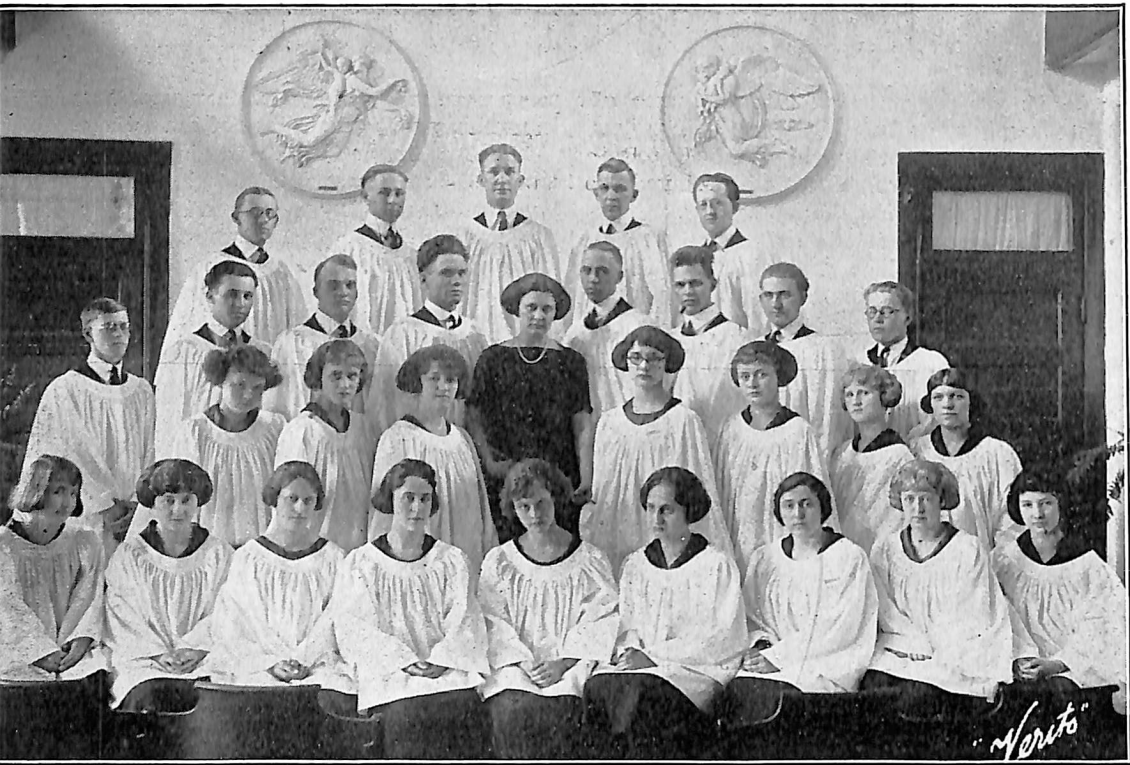
An Early A Cappella Choir