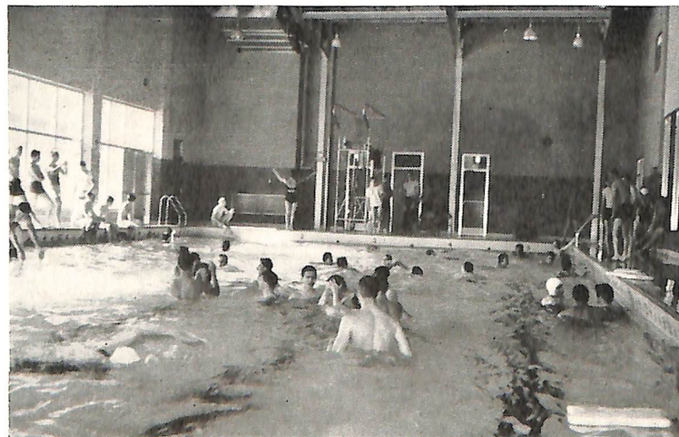
The Water's Fine