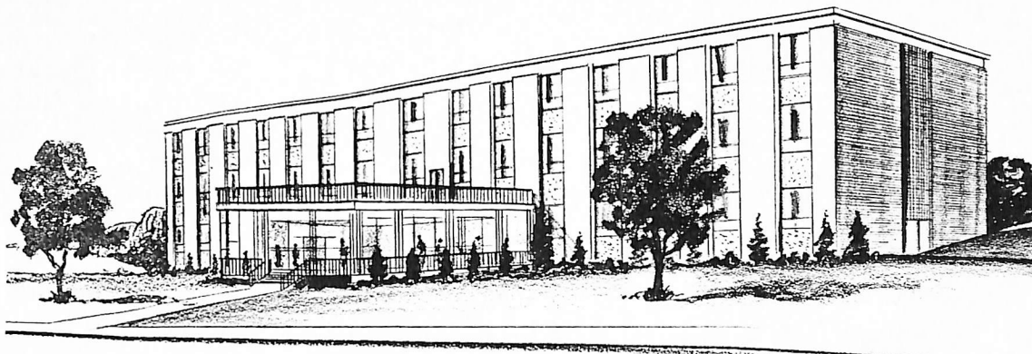
Holling Hall, Residence For Men

Published Monthly Except July and August