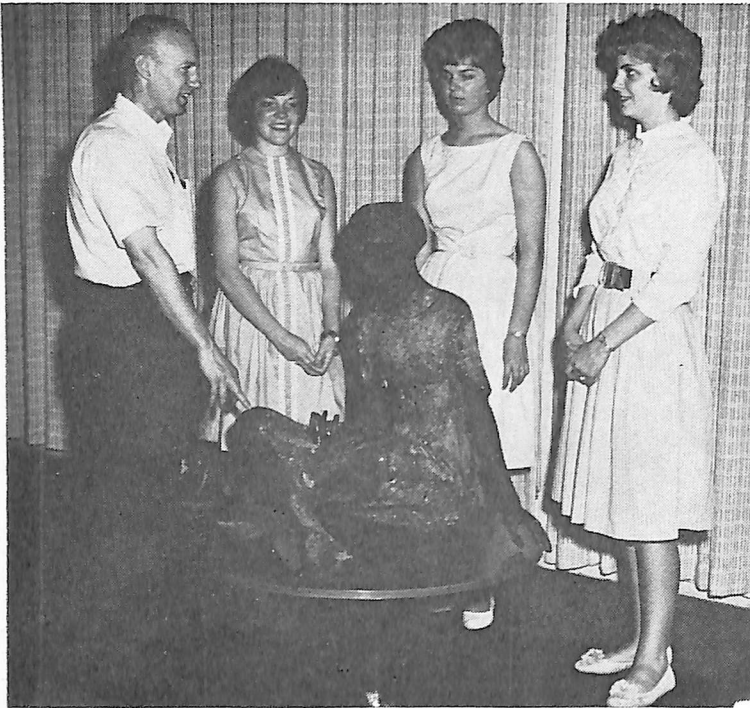
"Seated Woman With Bird"