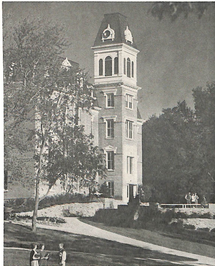
Old Main Pictured