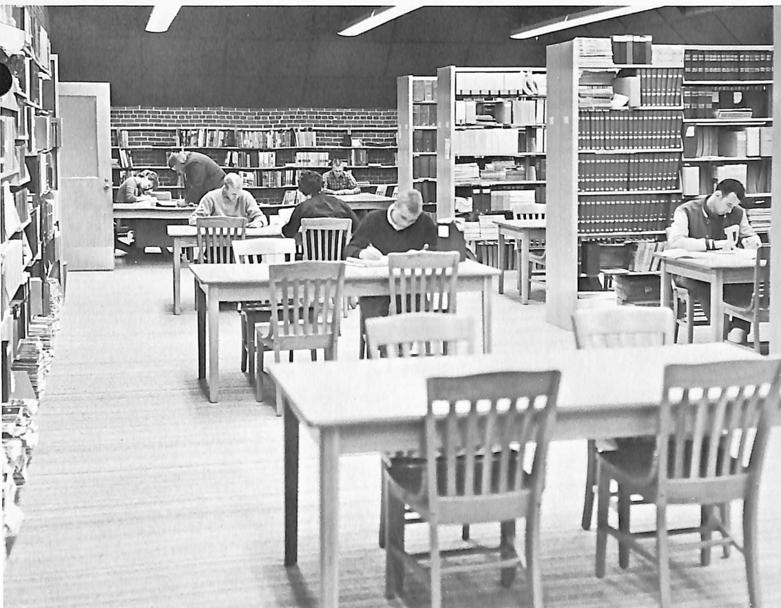
NEW READING ROOM It Used to be a Chapel