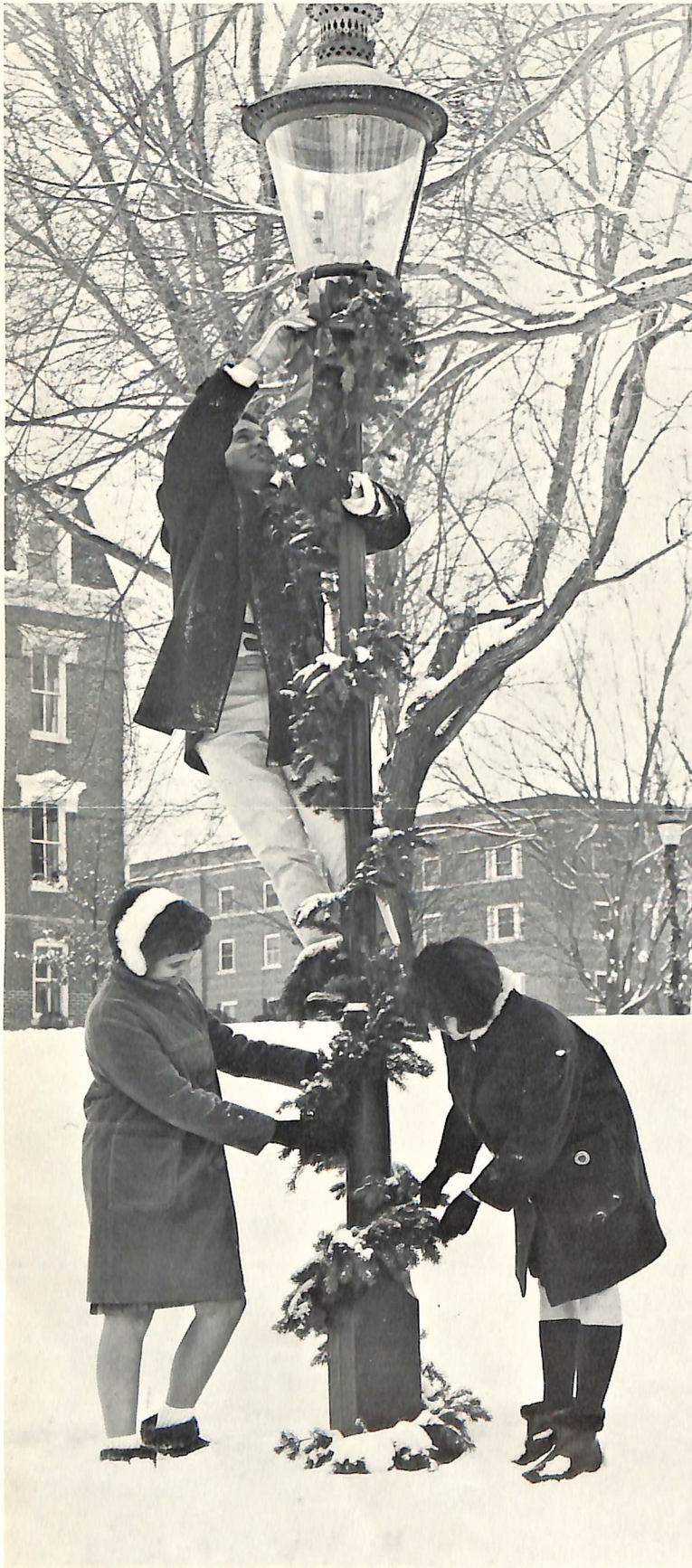
CHRISTMAS DECORATIONS Danish Gaslamp Decked in Green