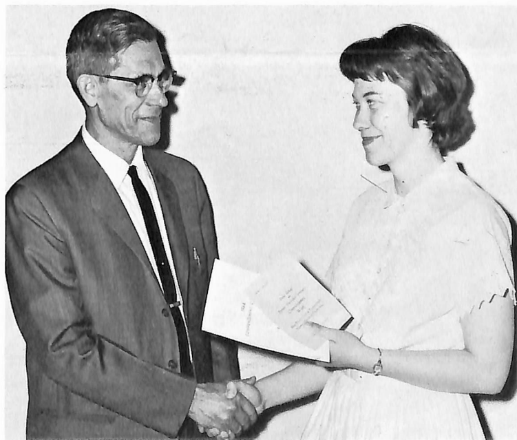
DEAN AND DAUGHTER Salutatorians Saluted