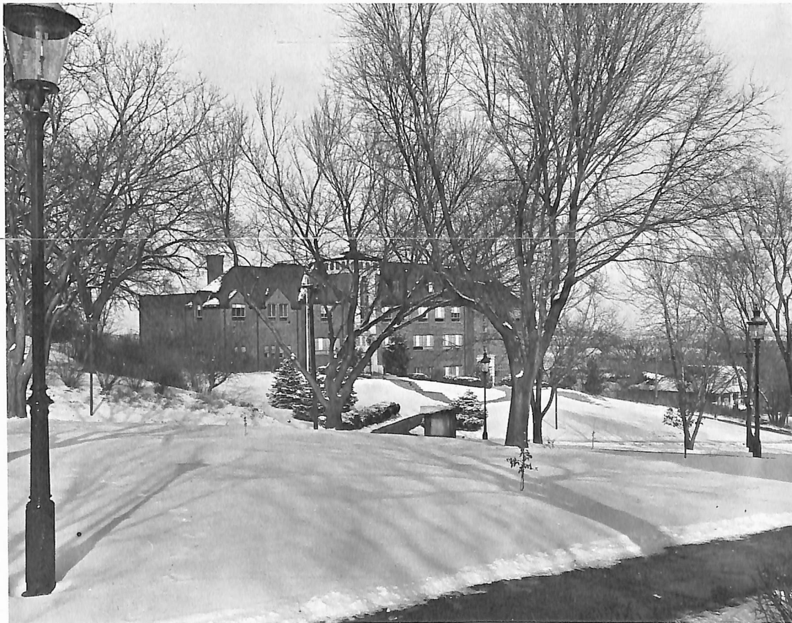
A fresh fall of heavy, wet snow . . . side-walks are scooped but there is nobody to walk on them yet; the campus is deserted under a pale winter sun. Quiet . . . peace.

Alumni meeting in Blair at Homecoming voted to set 15 thousand dollars as next year's Annual Appeal goal. It is the same as this year's target.