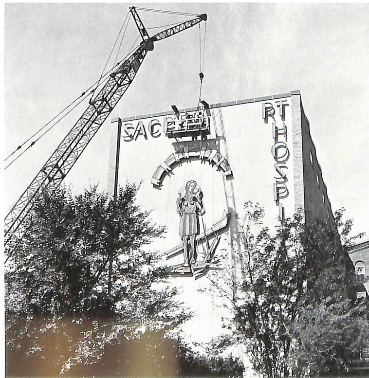
Finished work (left). Giant crane hoists it into position (above).