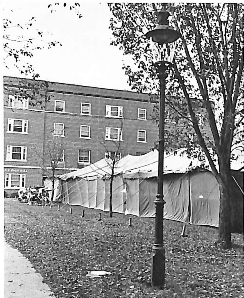
Homecoming preparations kept students busy for weeks. Work crews put up a huge tent (left) for Tivoli