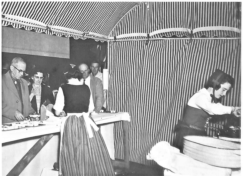
Food stands, games, and entertainment to be part of Tivoli II.