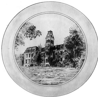
Actual size 8" in diameter

Dana College and Bing & Grondahl present: