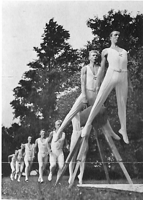
Young Danes in action.

Tickets are now available from the Public Relations Office, adults $2.00 and students $1.00. Tickets will also be available at the door on the evening of the performance.