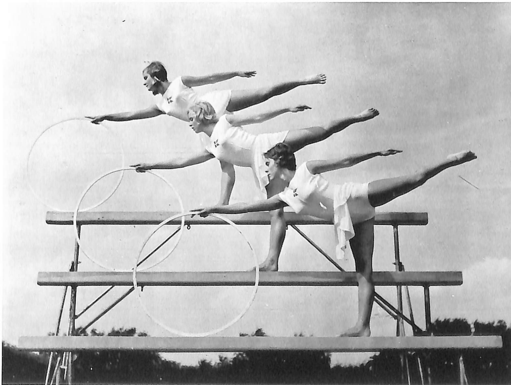
Gymnasts display grace and athletic prowess.