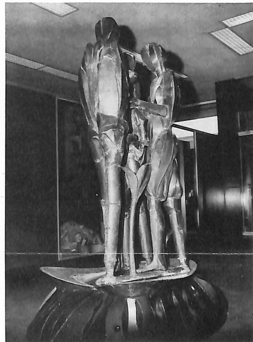
Fountain in Chicago.