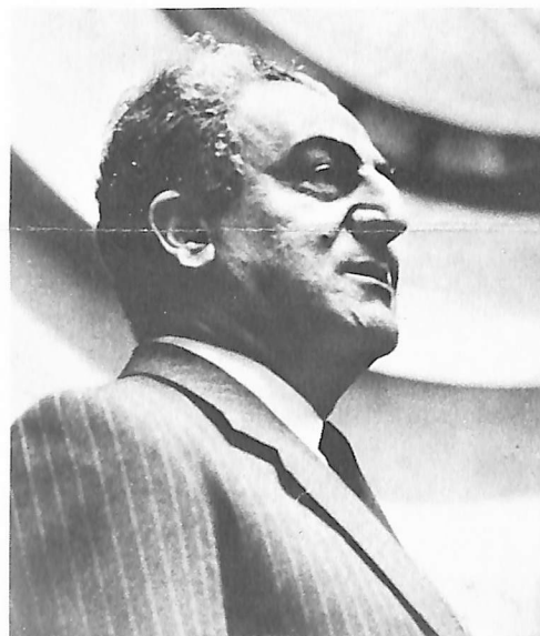
Dr. Charles Malik

Dr. Malik has lectured widely in this country and is renowned the world