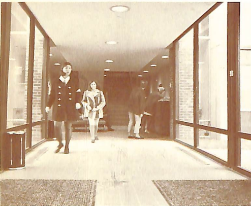
Blair Hall, new residence hall for women, is joined to Mickelsen Hall through a glassed-in enclosure. Although similar in design to Mickelsen, Blair Hall operates independently having its own lounge, chapel, laundry and recreation facilities.