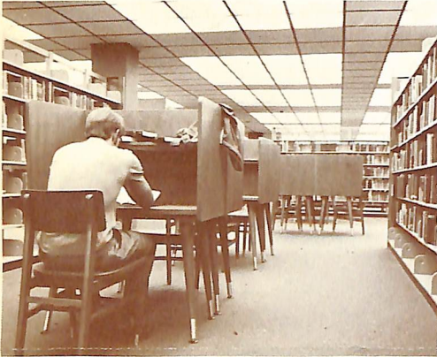
Some five hundred individual study carrels are provided in the new C. A. Dana-LIFE Library. The carrels replace the traditional library tables used in the Pioneer Memorial Library reading room.