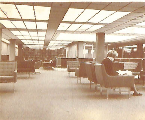
The tastefully decorated second floor lounge of the new Library provides comfortable surroundings for browsing and recreational reading. The building also contains a smoking lounge, typing room and individual faculty research quarters.