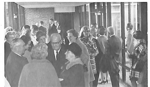
A large crowd of alumni, Blair area residents and other friends of the College, were on hand for the Dedication of Blair Hall and the C. A. Dana-LIFE Library on Sunday afternoon. Both buildings were open for public inspection following the brief ceremonies.