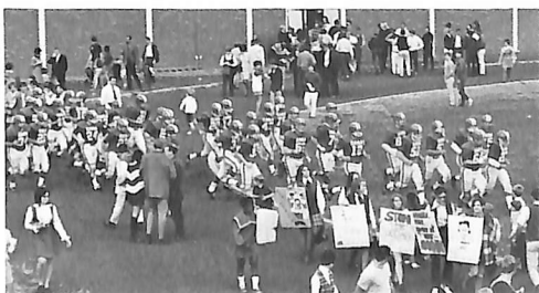
The Vikings, who began a Homecoming-game winning streak last year, repeated that effort by defeating Sioux Falls College, 24-20, for a capacity crowd of students and alumni on Saturday afternoon.