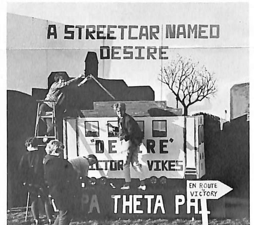
Eight campus organizations participated in the annual Homecoming Outdoor Displays competition. Two of the winners were the Freshman Class (left) and Kappa Theta Phi Sorority, (right).