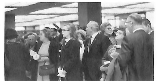
An estimated crowd of three hundred persons participated in the Dedication programs and toured the new facilities on Sunday afternoon.