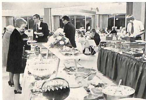
The Saturday evening buffet, a tradition at many Dana Homecomings, was revived this year and alumni were treated to an excellent dinner prepared by the College food service staff.