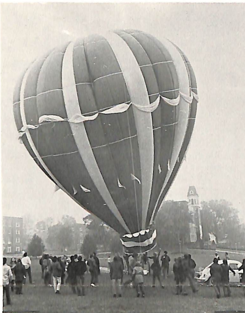
Nebraska's only hot-air balloon was scheduled to be launched from the campus on Saturday afternoon following the football game but the weather didn't cooperate. Old Main is barely visible through the fog which indicates what kind of day it was.