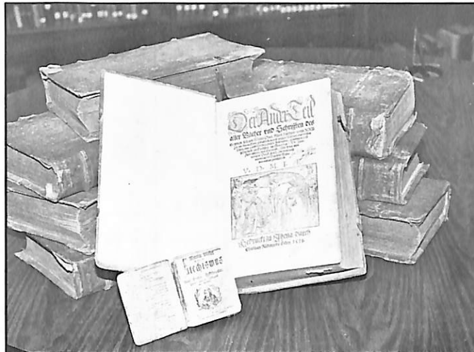
Eight-volume set of Luther's writings and a pocket-sized Small Catechism are in Dana's Heritage Room.