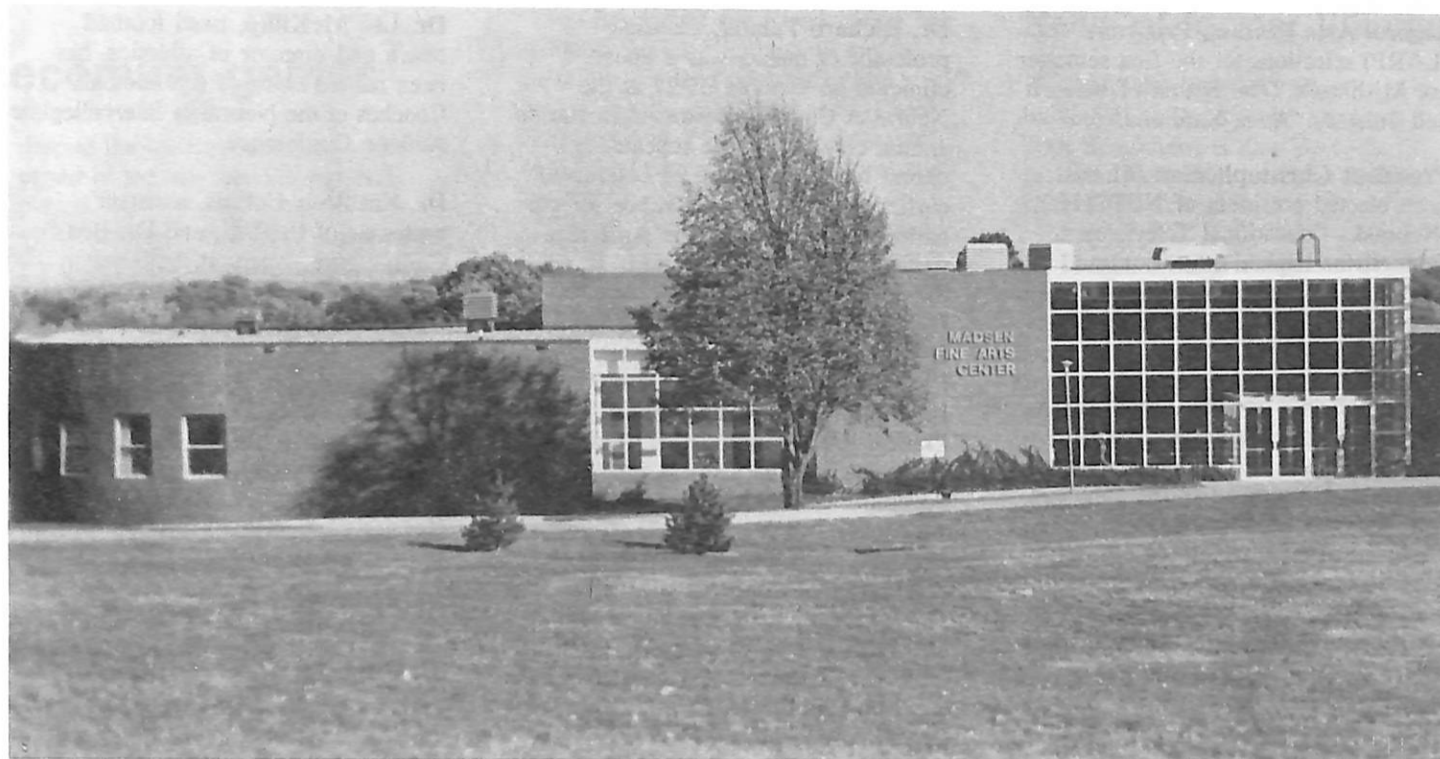
Above: The new art department addition to the Madsen Fine Arts Center is at the left. The building is also home to the music and theatre departments.