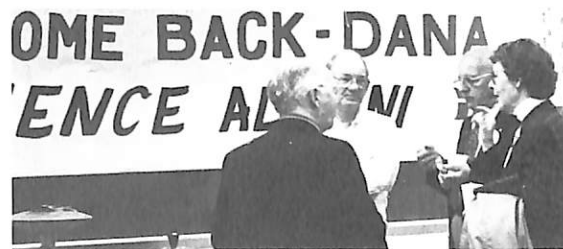
Many math and science alumni returned for a Saturday morning open house and reunion in the C.A. Dana Hall of Science.