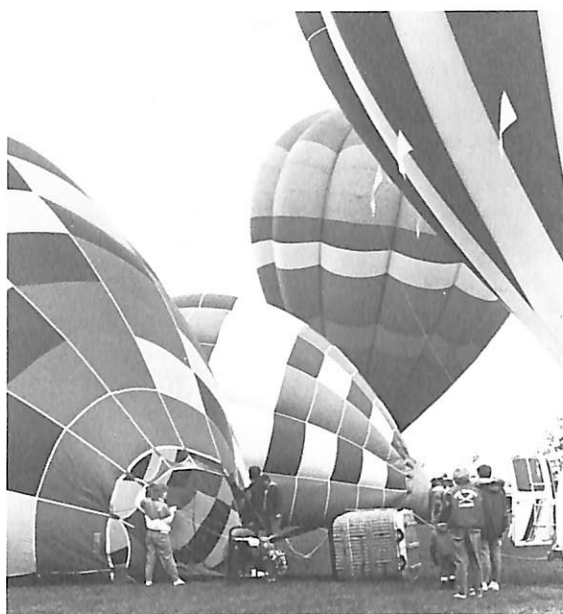
Seven hot air balloons lifted off early Saturday morning, forming a colorful procession across a clear, sunlit sky.