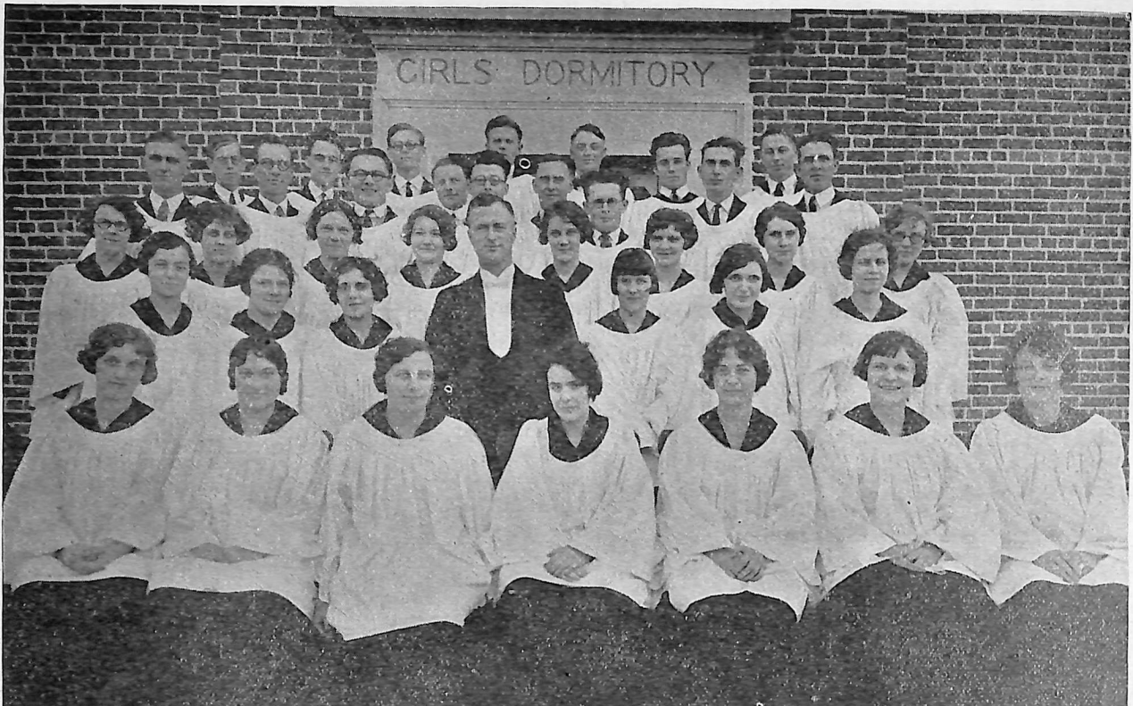
DANA COLLEGE CHOIR

student you are a member of this organization, and that you may express through it your desires in regard to the different activities at Dana as well as in matters which concern you directly? Do you realize that your attitude toward this organization is an index to the interest which you will show in regard to matters of greater importance? Let us take an active part in this matter by attending our student body meetings.