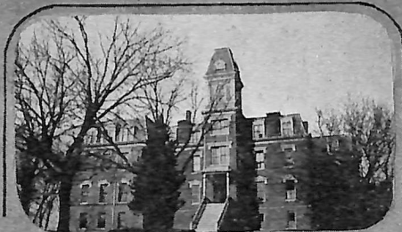
Dear Old Dana