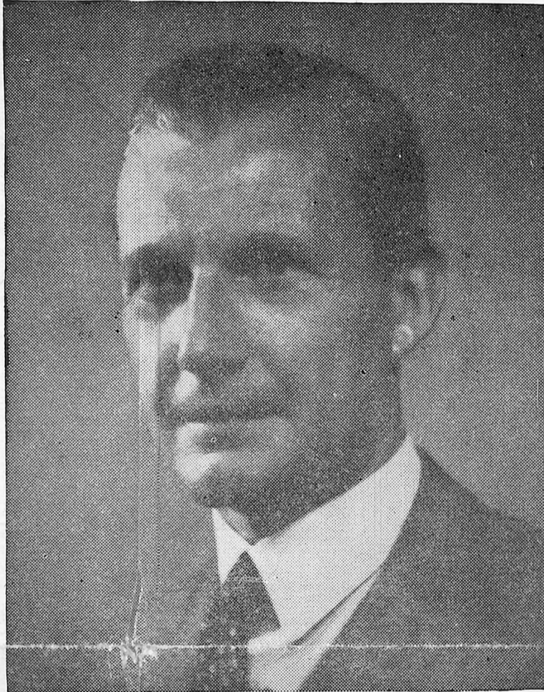
Minister De Kauffmann