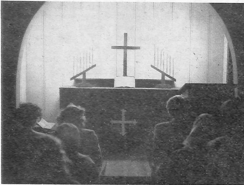
Students Inaugurate Devotional Plan