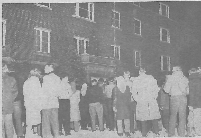
"OH COME ALL YE FAITHFUL"

Things have been moving swiftly from that evening on. Girls woke early one morning to bring a Christmas serenade of carols to the boys' dormitory. Not to be outdone, the boys returned the compliment a few days later. Then both