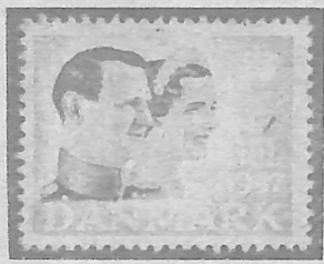
Their Royal Highnesses, the King and Queen of Denmark

This year's Christmas seal from Denmark, first nation in the world to issue this symbol of Yuletide charity, reminds Danians of a royal visit to the campus. Featured on the 1947 seal are Their Royal Highnesses, the King and Queen of Denmark, who visited Dana on April 19, 1939 as Crown Prince Frederick and Crown Princess Ingrid.