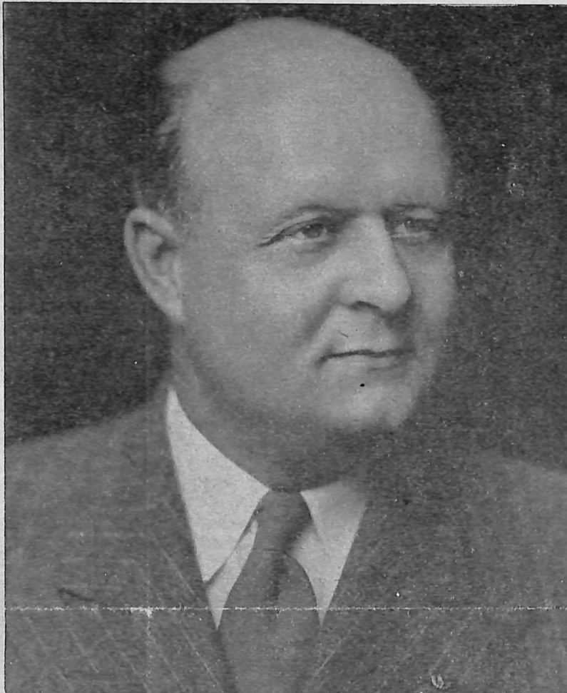
Governor Val Peterson