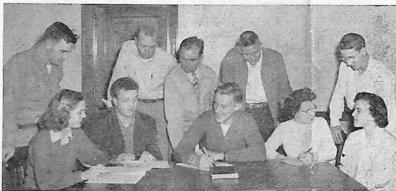
The above photo shows the Committee hard at work making plans for the largest expected Homecoming of former Danians.