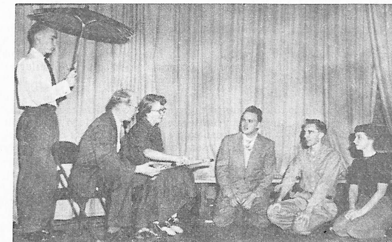
"Mikado" cast members at a rehearsal for the production next Wednesday.