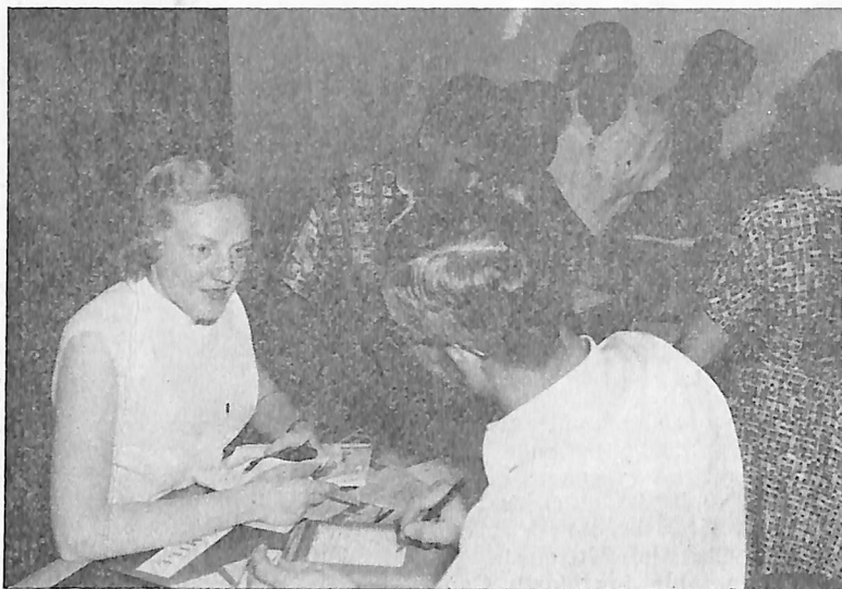
Payment of tuition and fees is a major part of registration. Pictured above are several freshmen completing this phase on registration day.