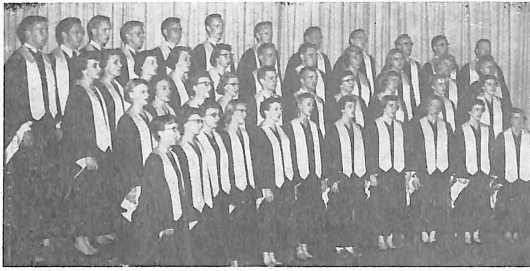
1953 A cappella Choir