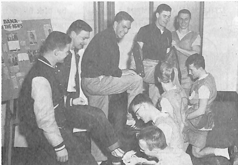
Recently-initiated D club members shine shoes as part of day's duties.