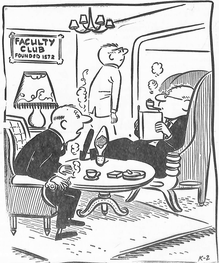
"Looks like an interesting news item, Professor Snarf—would you mind removing your shoe?"