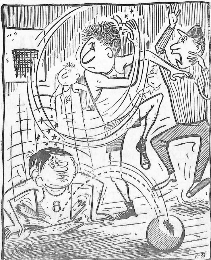
"Boy, I saw you foul him THAT time."