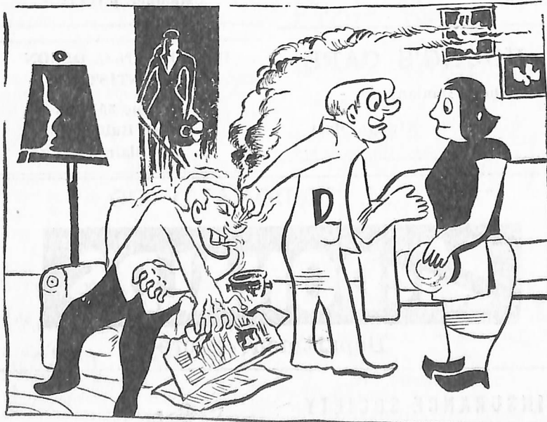
"Do you smell something burning?"