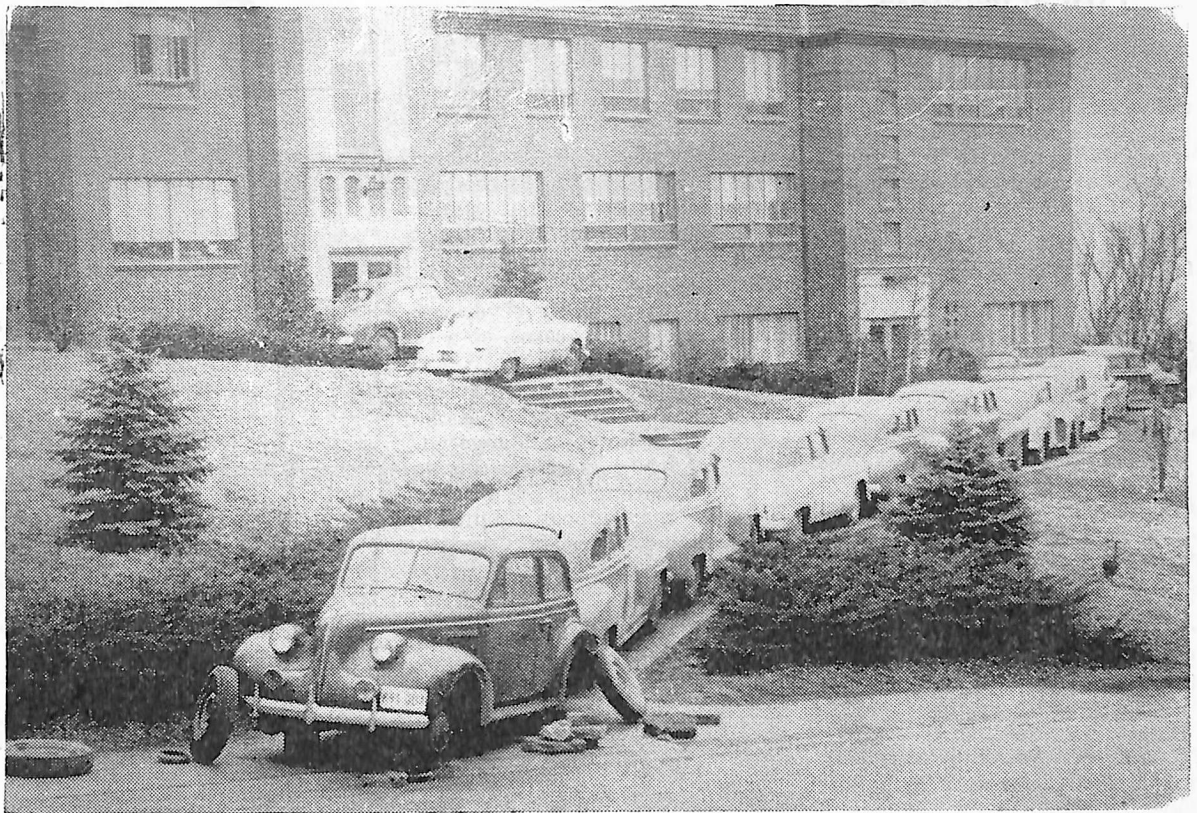
An unusual scenic shot of Pioneer Memorial, taken on the "morning after." We hasten to assure our readers that this is not the usual parking arrangement followed at Dana.