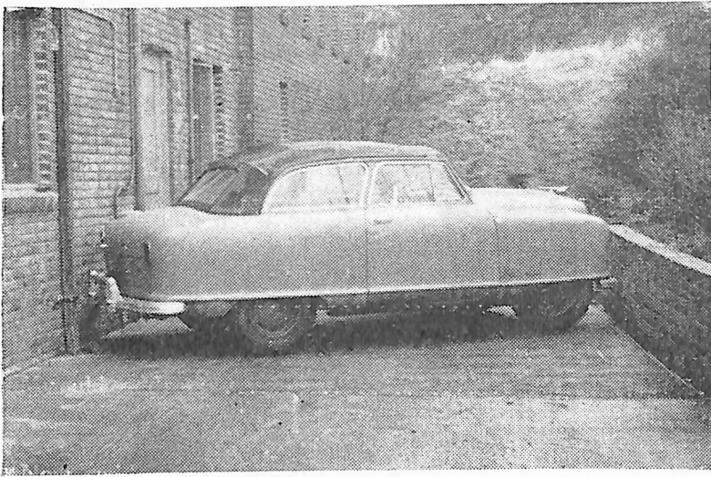
Takes a good driver to park 'em like that!