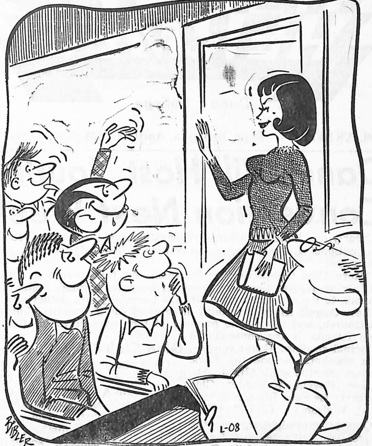
"As you see, Miss Latour, when you come in late you disturb the whole class."

A group of enterprising students, realizing the potentialities of the event, picked up the discarded mail and collected the stamps—four or five dollars' worth!