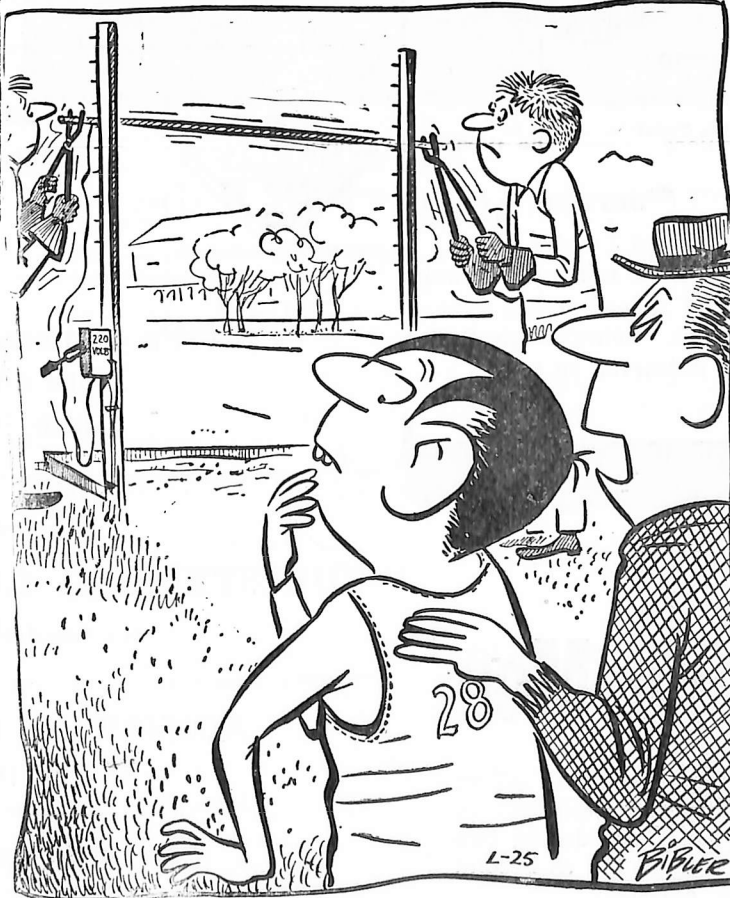
"And this is the height you've always had so much trouble clearing, Worthal."