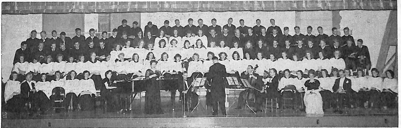
"All right, all right, who's the wise guy singin' 'Sh-boom'?"