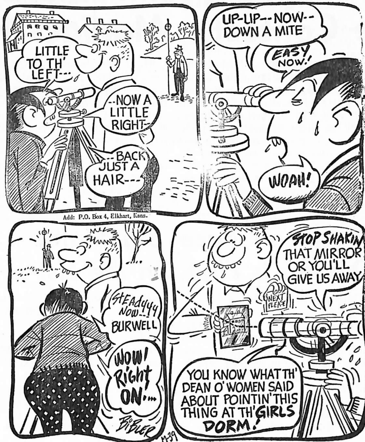
Add: P.O. Box 4, Elkhart, Kans.