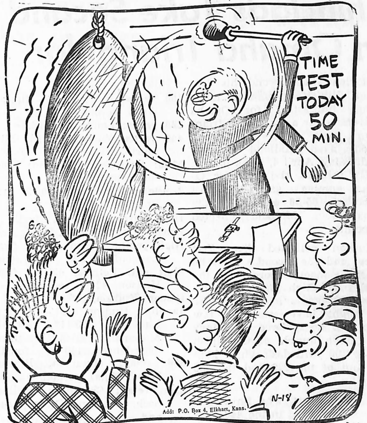
"—YOU HAVE USED TH' FIRST 10 MINUTES — 40 TO GO!"