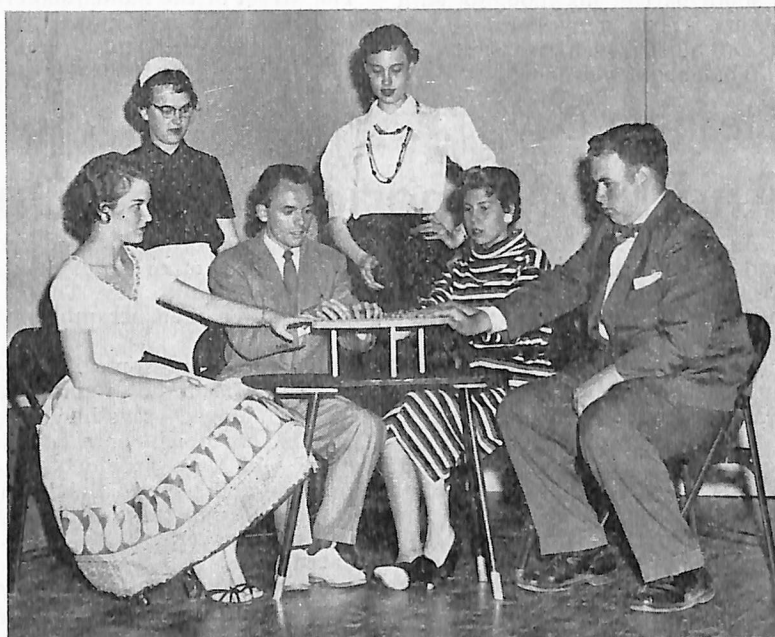
Members of the cast of "Blithe Spirit" rehearse the seance scene.

Most of the stage properties, with the exception of the furnishings from Cox Furniture Co. in Blair, were made by the actors.