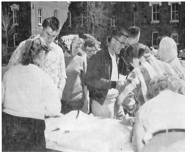
Workers take time out for that well-known "coffee break."