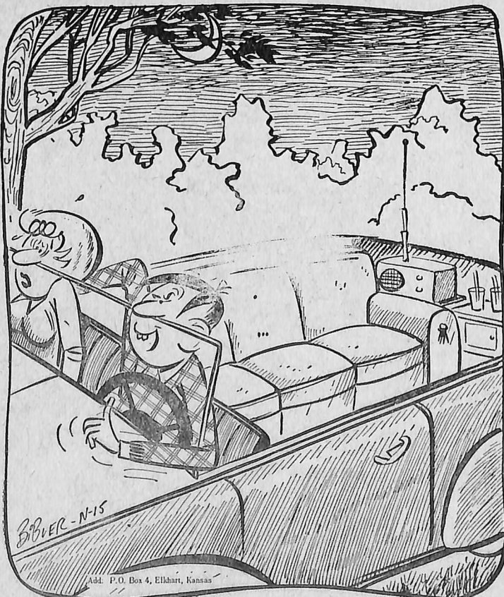
"IF IT'S TOO CROWDED UP HERE FOR YOU—THERE'S MORE ROOM IN BACK."