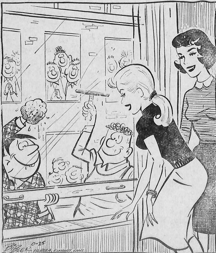
"NICE OF YOU BOYS NEXT DOOR TO WASH OUR WINDOWS — WE HADN'T EVEN NOTICED THEY WERE GETTING DIRTY."