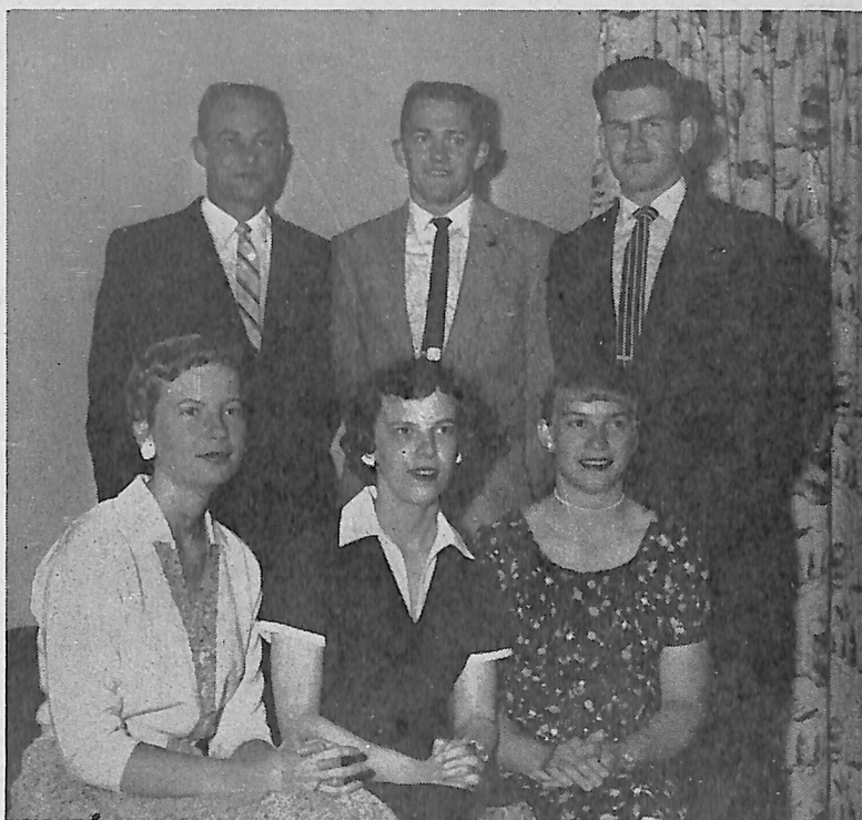
May Fest Royalty . . . the coronation is tomorrow night