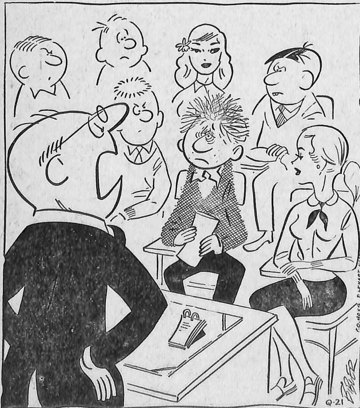
"IT APPEARS TO ME ONLY ONE OF YOU TOOK THE TROUBLE TO DO THE OUTSIDE ASSIGNMENT LAST NITE!"