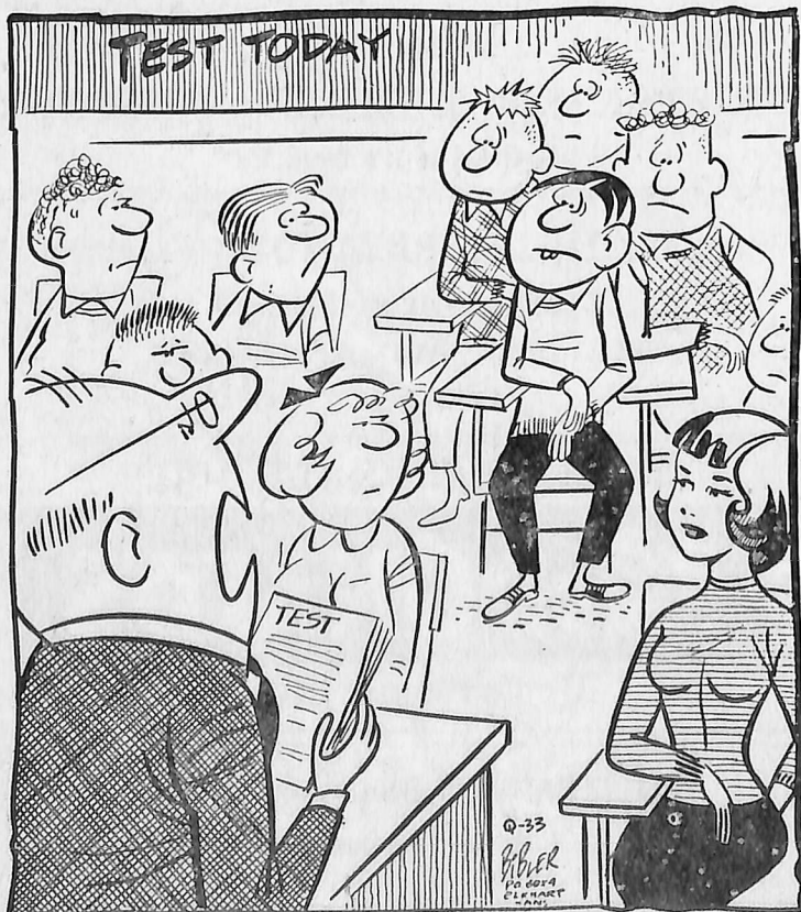
"WHY NOT SPREAD OUT, BOYS? NO NEED FOR ALL OF YOU TO FLUNK."