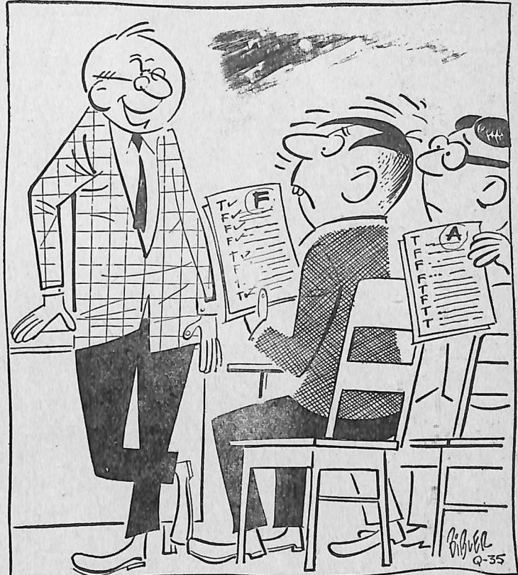
"YES I KNOW YOU HAVE THE SAME ANSWERS AS SMITH - YOUR ANSWERS ARE WRONG BECAUSE YOU TOOK A DIFFERENT TEST."