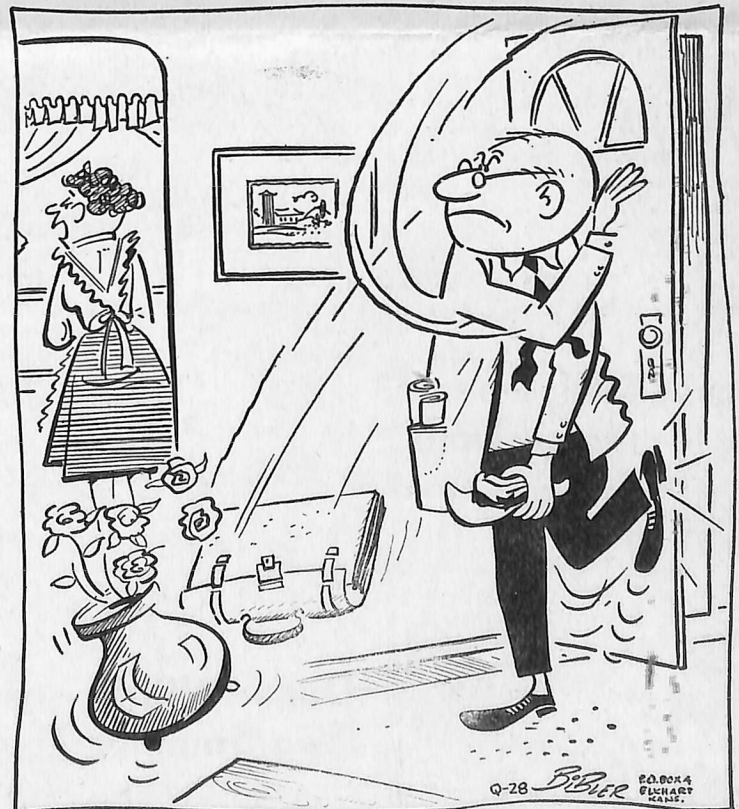
"HOW DID THE FACULTY MEETING GO, DEAR?"