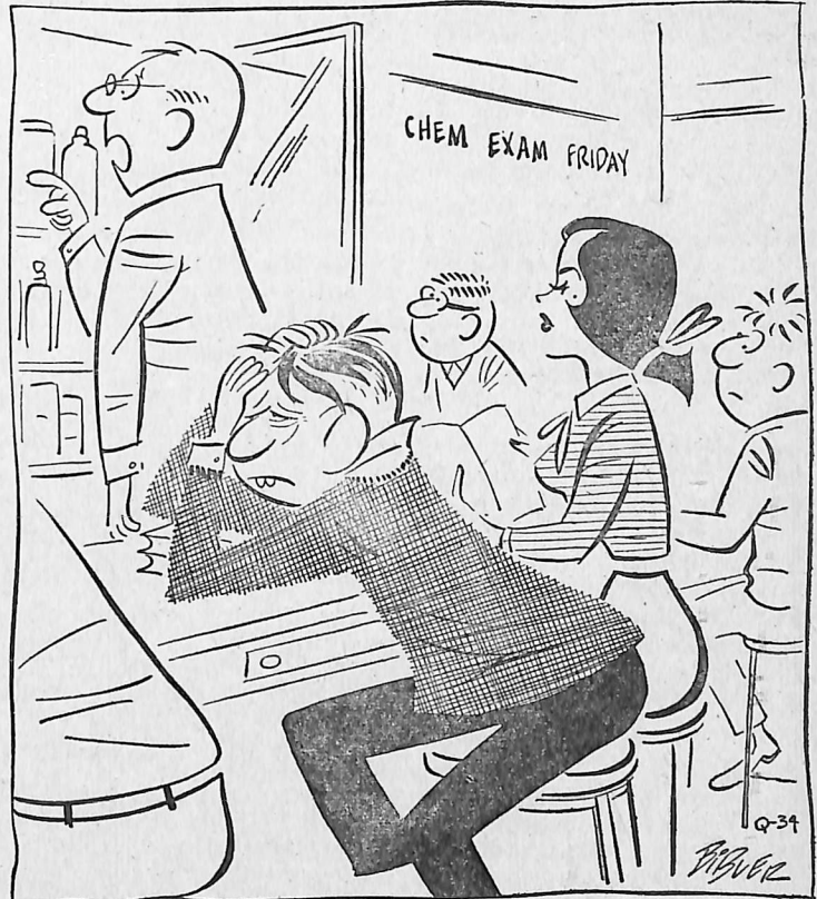
"DID ANY OF YOU HAPPEN TO FIND THAT BOTTLE OF ALCOHOL THAT WAS MISPLACED YESTERDAY?"