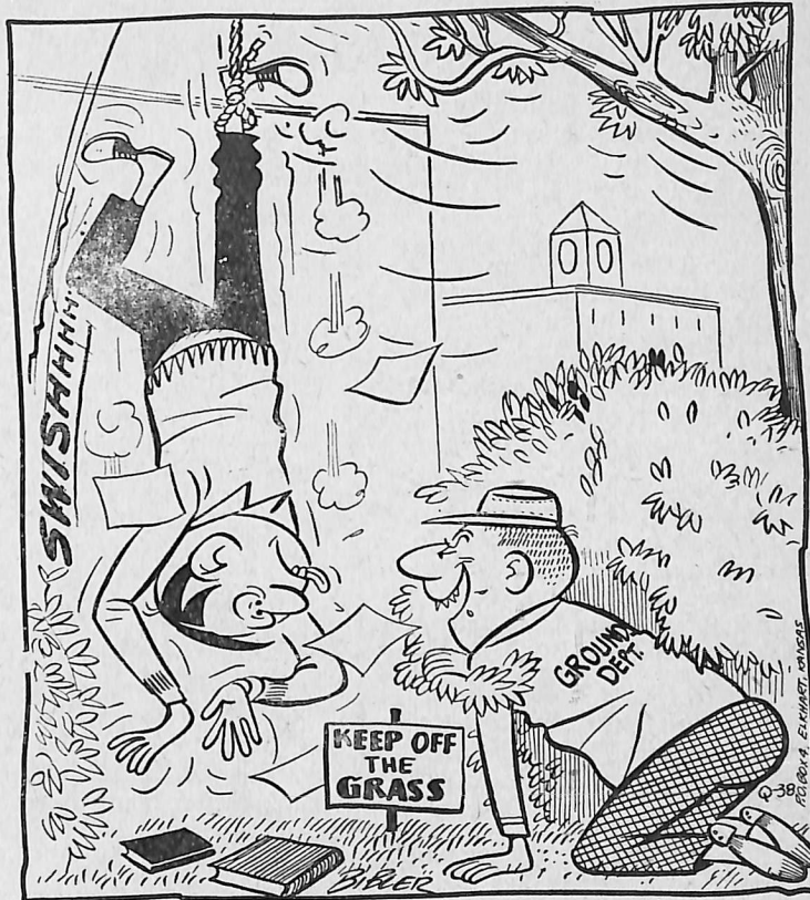
"DIDN'TCHA SEE TH' SIGN, BUDDIE?"