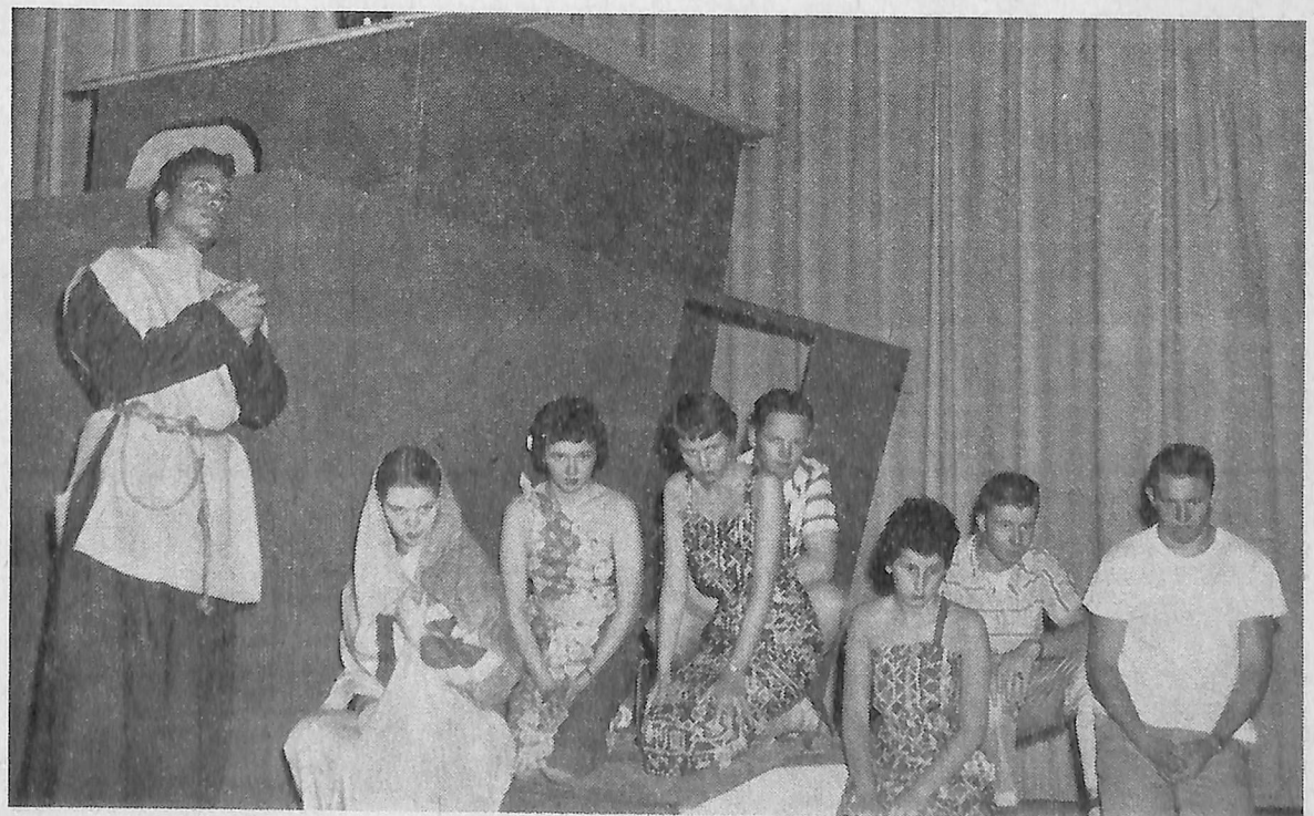
Players in Andre Obey's "Noah" rehearse for tonight's performance.